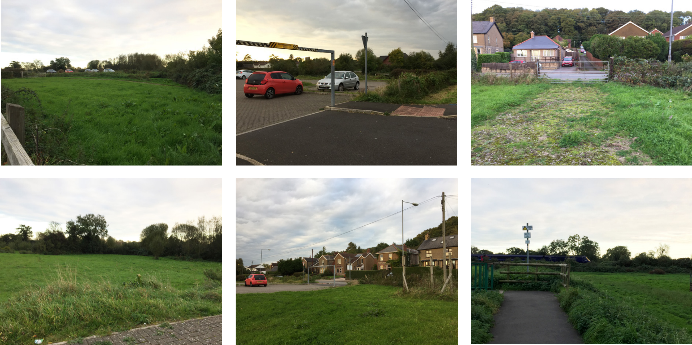
SITE PHOTOS The existing Three Fields Site