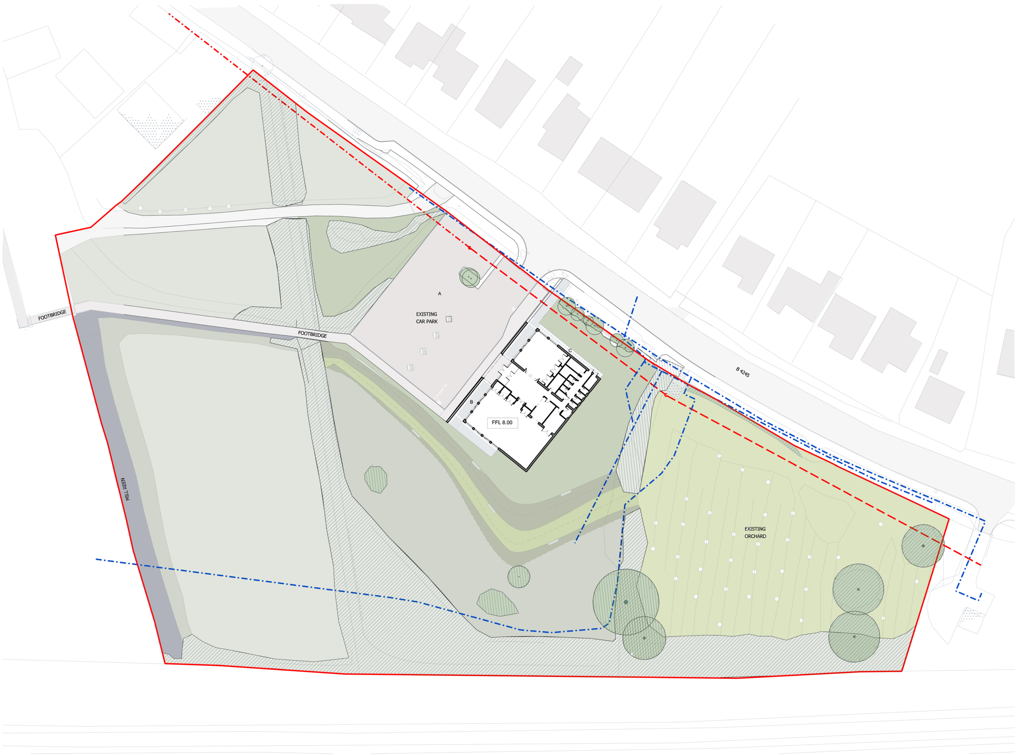
PROPOSED SITE LANDSCAPING PLAN Siting the building within the Three Fields Site